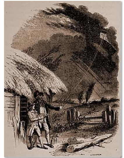
Franklin's kite experiment.

At the same time, Franklin began to gain an international reputation as a man of science, notwithstanding the fact that his formal education had come to an end at the age of 10. Franklin was endlessly curious to learn about how the physical world worked and how such knowledge could be put to use for the benefit of humankind. He undertook his best-remembered and riskiest experiment when he flew a kite in a thunderstorm, hoping to prove that lightning was a form of the then little-understood phenomenon, electricity. He went on to invent the lightening rod, a device which saved his own house from burning down when it was struck by lightning and has saved countless dwellings and lives since then. He was interested in heat and convection, and he invented an iron stove that proved a big improvement over the drafty fireplaces of the day; in fact, the "Franklin stove" is still in use today.